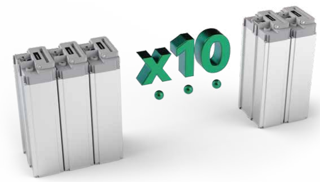
Scalable Battery System